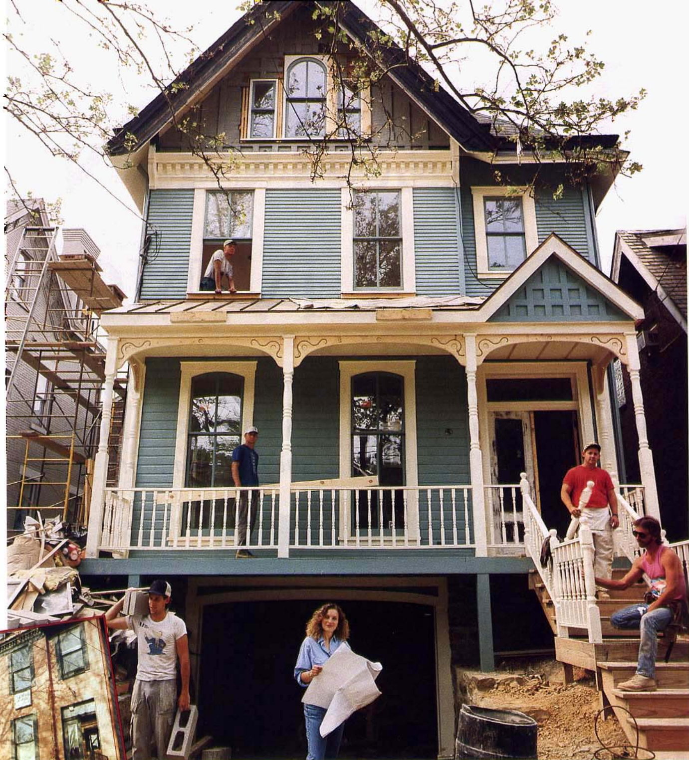
Before and after: the eyesore on the left had its red siding peeled to reveal intricate woodwork designs. Lengthening the first floor windows and adding a basement garage and porch completed the exterior transformation of this Victorian.

for cold water flats," she says, laughing. "And I was told my paintings were too pretty. It was at a time when a lot of people were doing garbage dumps, lots of black, and lots of white. I was hung up on cobalt violet."